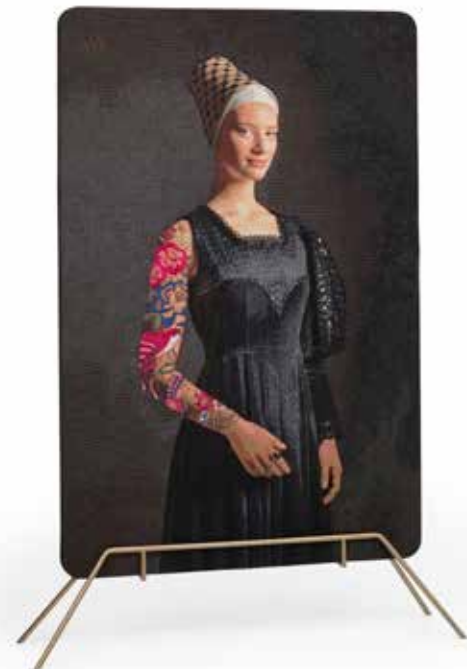
Fame Frame Odilia 100x150cm & Golden Art Clip