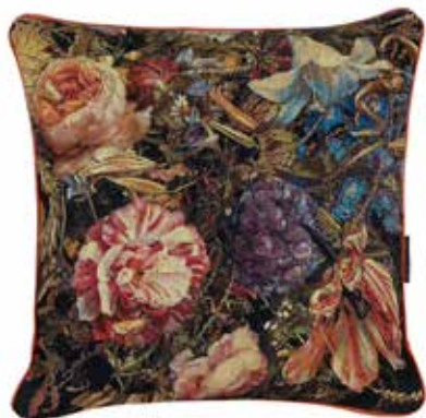
Pillow case Give & Take - Flowers with orange pipping 45x45cm