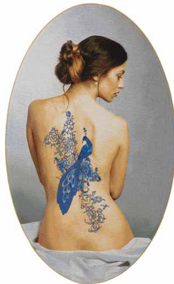
Wall Frame Gilga Royal 100x150cm or Oval 70x115cm