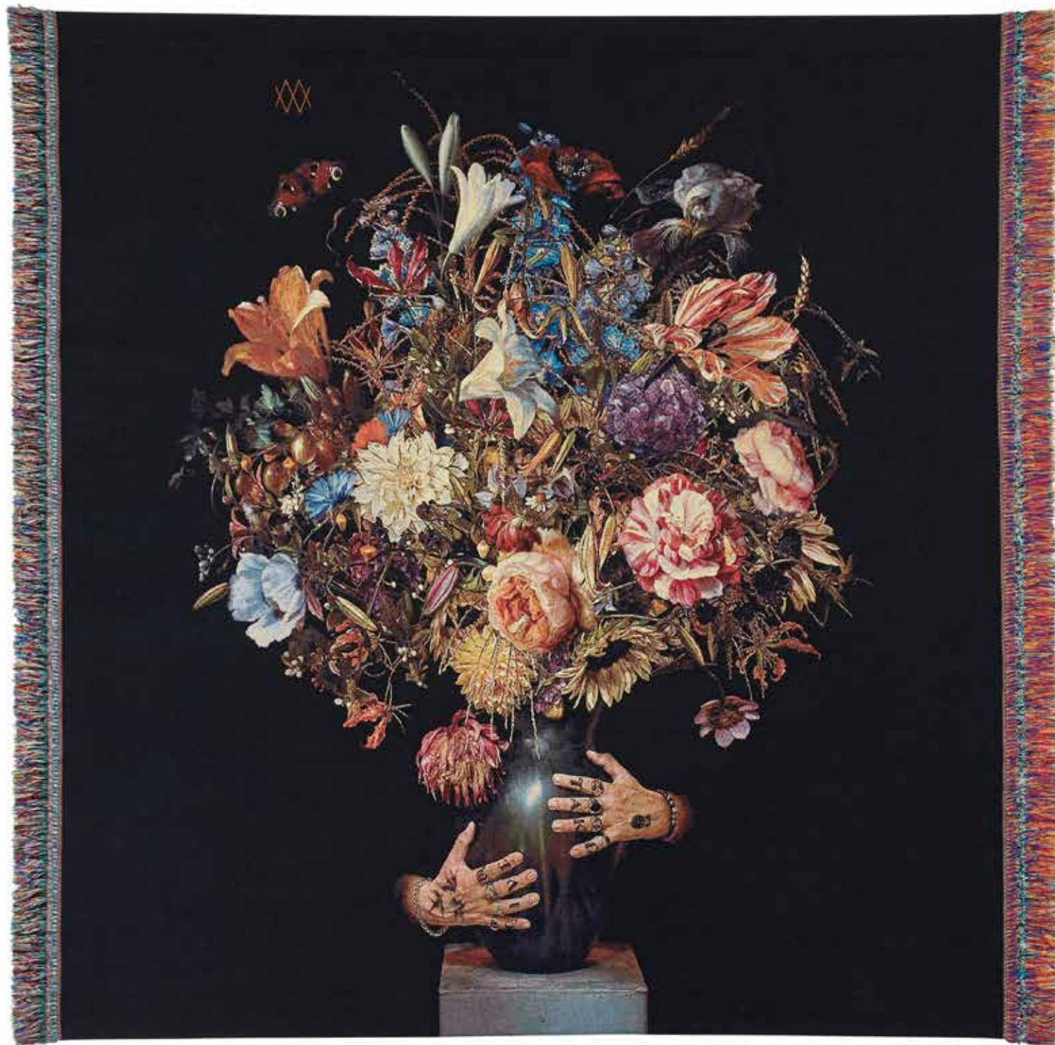
Gobelin Give & Take Black 160x150cm