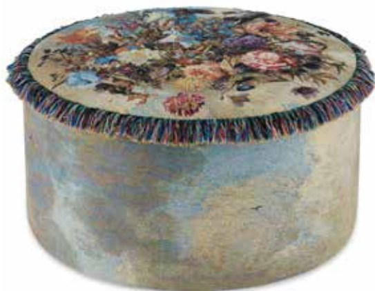
Pouf Give & Take Sky with fringes 70x40cm