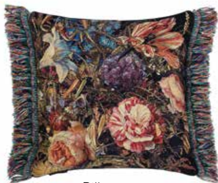
Pillow case Give & Take - Flowers with fringes 45x45cm