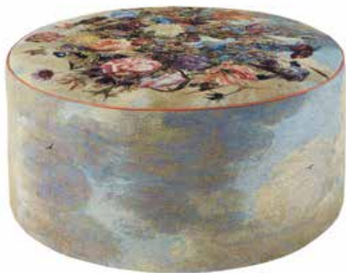
Pouf Give & Take Sky with orange pipping 70x40cm