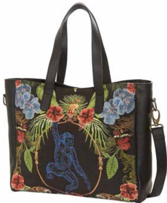
Shopper Zaru blue Gobelin with leather 37x30x12cm