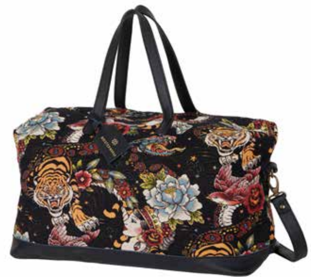
Weekender Tattoo Black Gobelin with leather 60x35x23cm