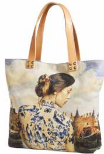
A 4 Shopper Gilga Delft Gobelin with leather 38x45cm