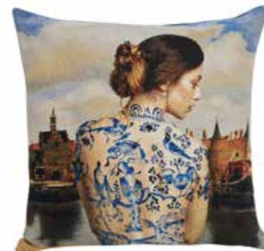
Pillow case Gilga Delft Gobelin with blue pipping 45x45cm 60x60cm 70x70cm