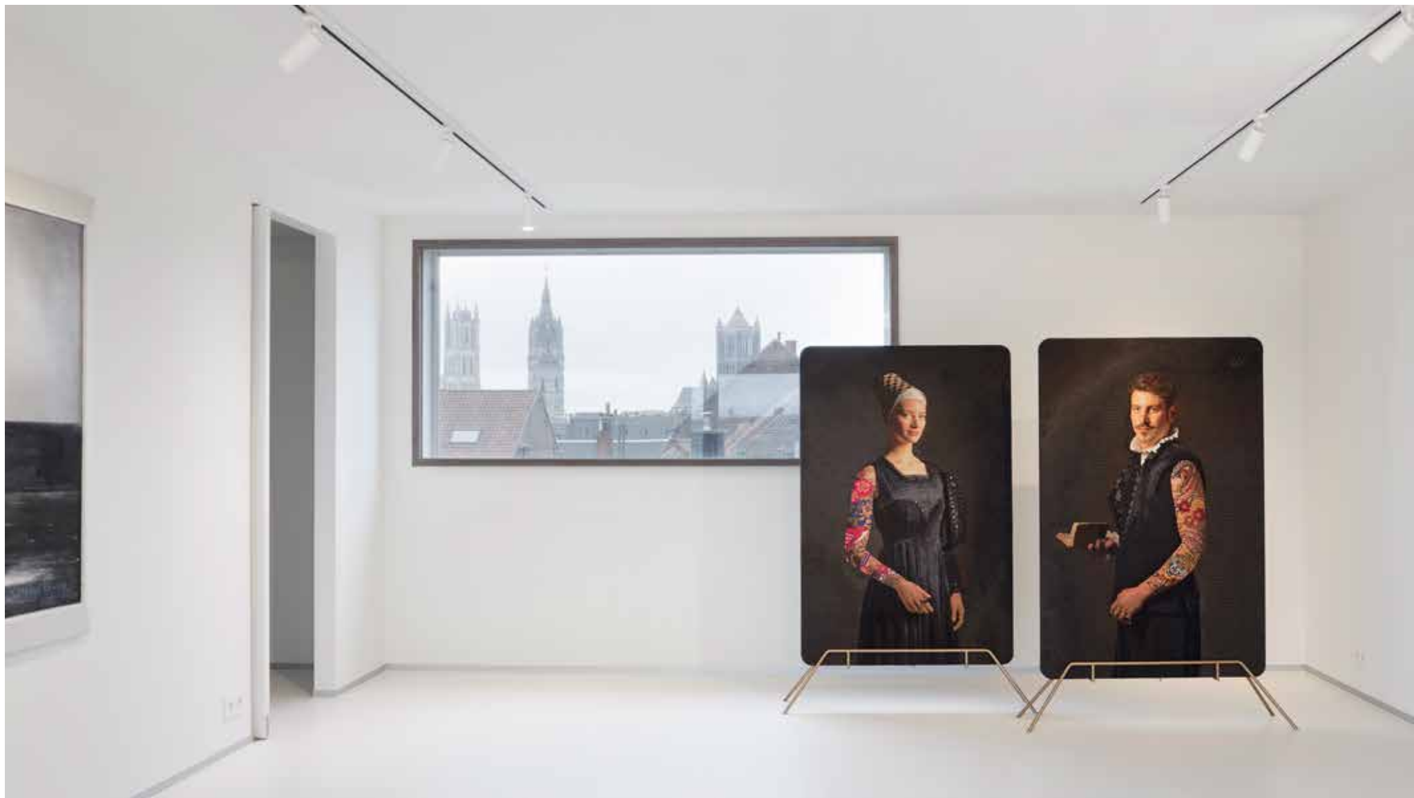
Fame Frame Odo & Odilia 100x150cm & Artclip