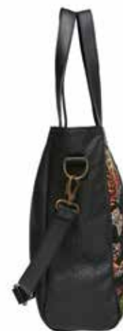
Shopper Tattoo Black Gobelin with leather 37x30x12cm