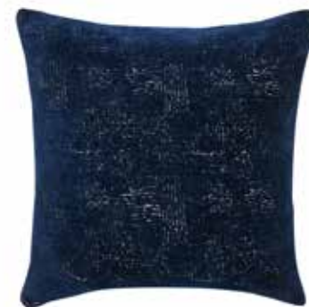
Pillow case Blue Velvet 45x45cm