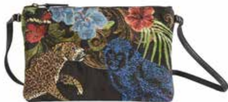
Clutch Deluxe Zaru blue Gobelin with leather 17x27cm