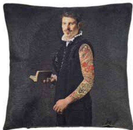
Pillow case Odo with Golden pipping 70x70cm