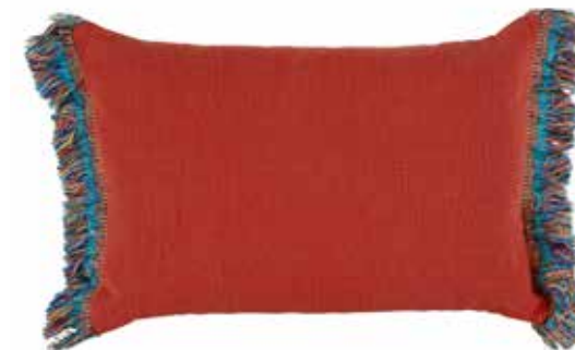
Pillow case Orange washed linen 45x60cm