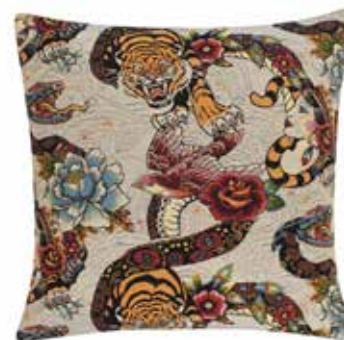
Pillow case Tattoo White 45x45cm