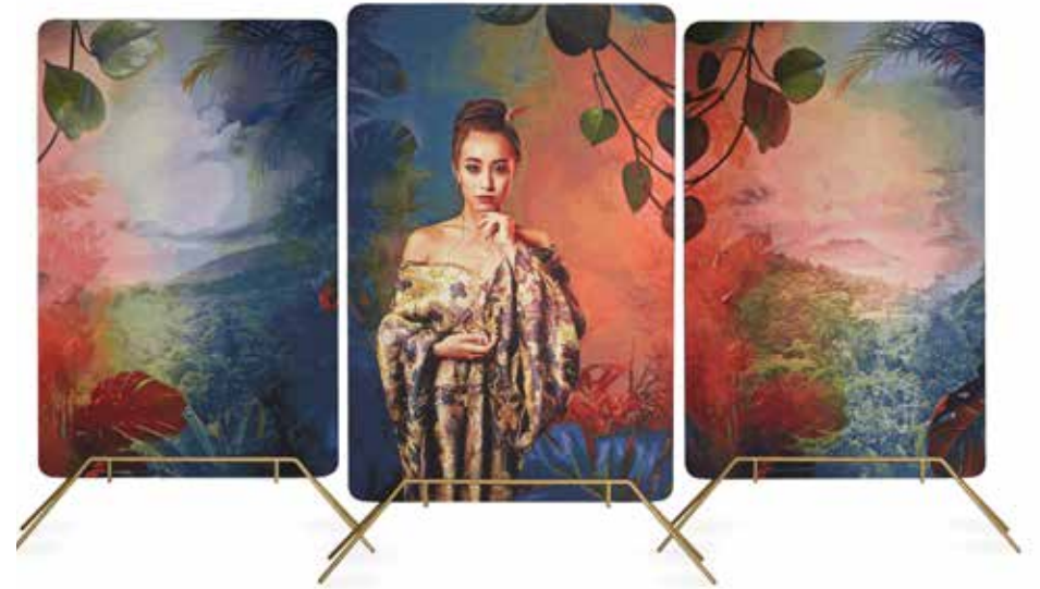
Fame Frame Zaru & Art Clip 100x150cm