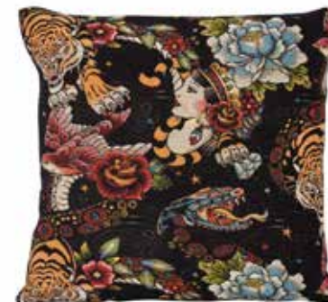
Pillow case Tattoo Black 45x45cm