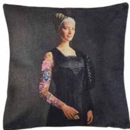
Pillow case Odilia with Golden pipping 70x70cm