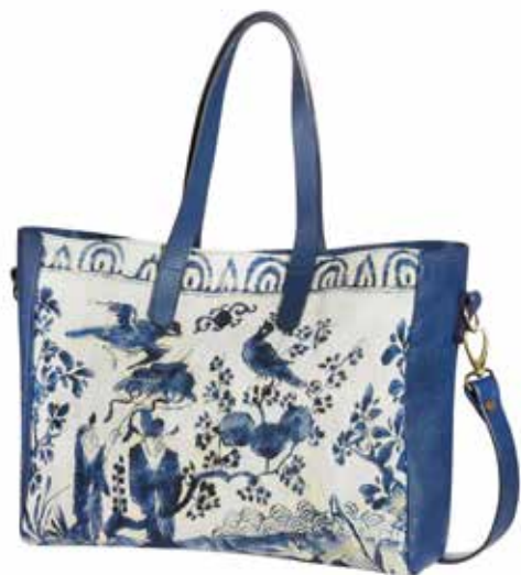
Shopper Delft all over Gobelin with leather 37x30x12cm