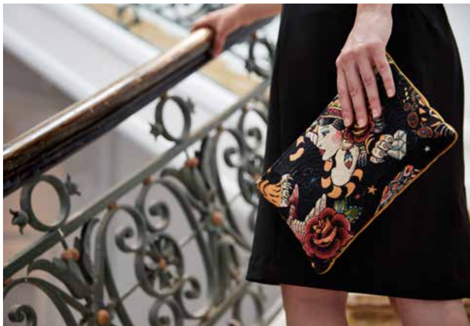
Clutch Tattoo black 17x27cm