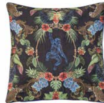
Pillow case Zaru Blue 45x45cm 70x70cm