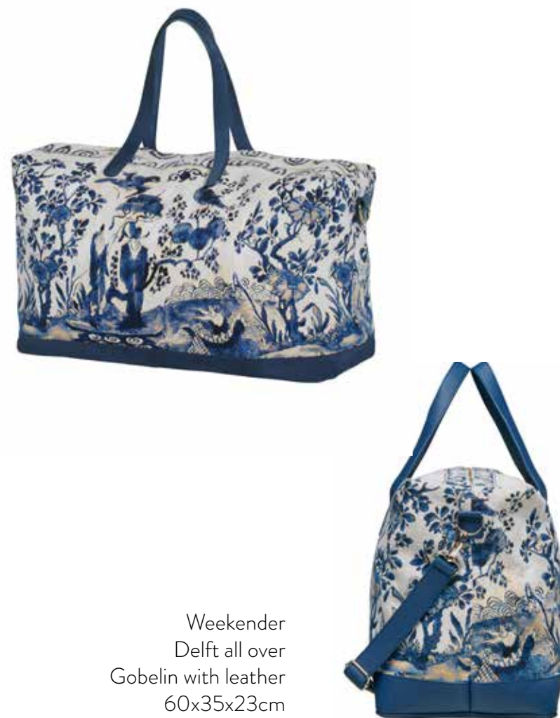
Weekender Delft all over Gobelin with leather 60x35x23cm