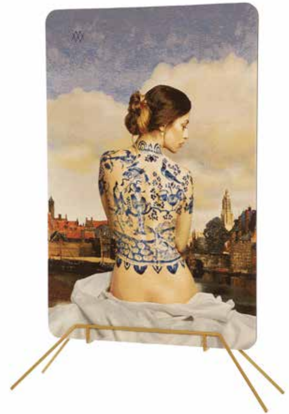
Fame Frame Gilga Delft 100x150cm & Golden Art Clip