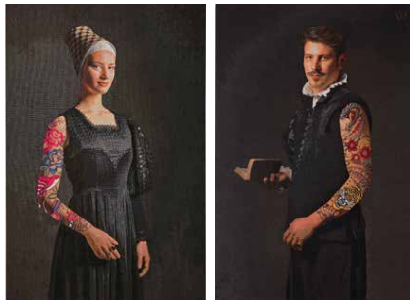
Wall Frame Odo & Odilia 100x150cm