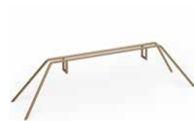
Art Clip Gold