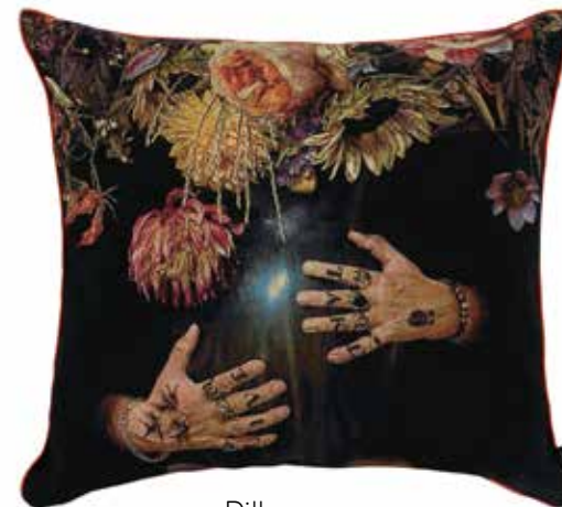
Pillow case Give & Take - Hands 50x60cm