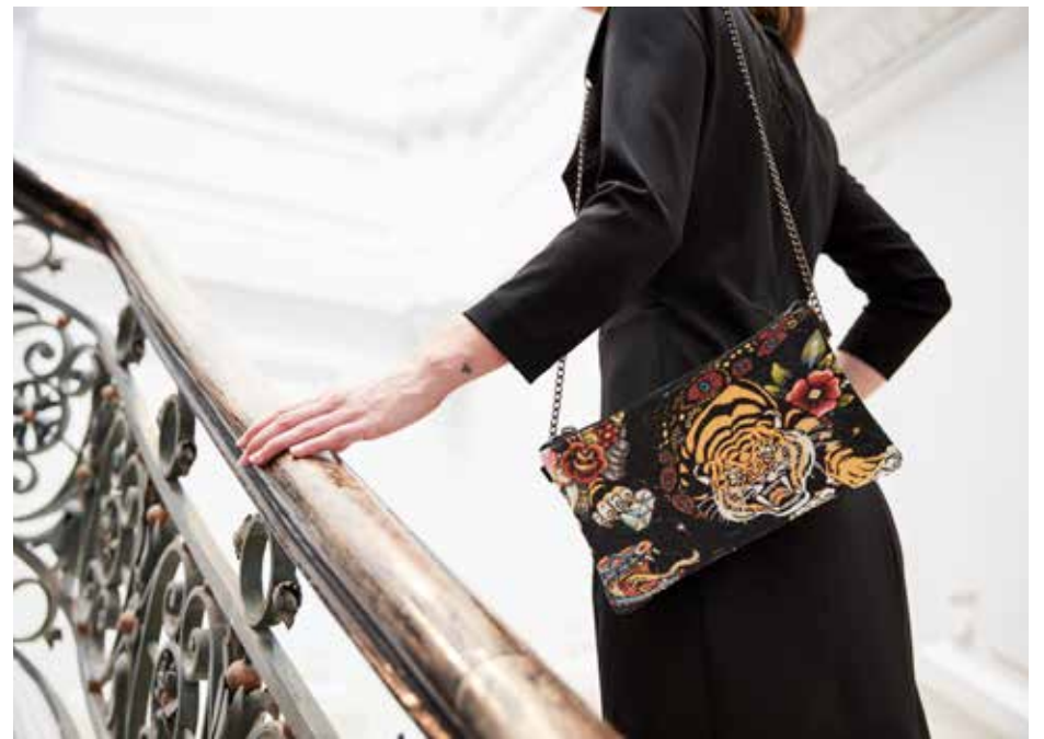
Clutch Deluxe Tattoo Black Gobelin with leather 17x27cm