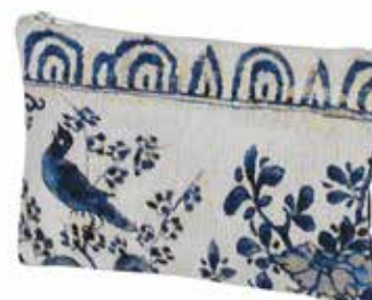
Clutch Delft all over Gobelins with blue velvet 17x27cm