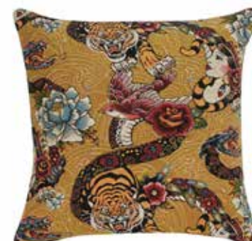
Pillow case Tattoo Ochre 45x45cm