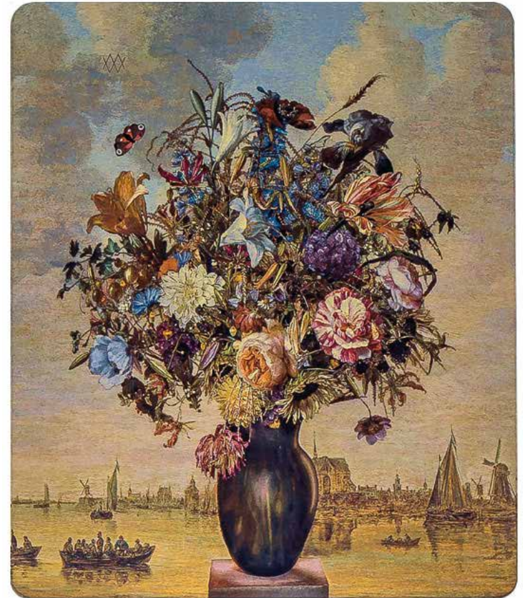
Wall Frame Give & Take - Harbour 130x150cm