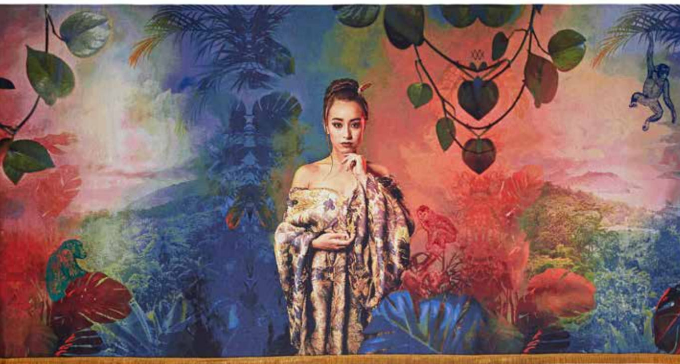
Gobelin Zaru 145x300cm with gold fringes