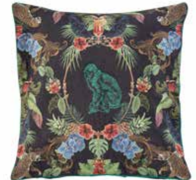
Pillow case Zaru Green 45x45cm 70x70cm