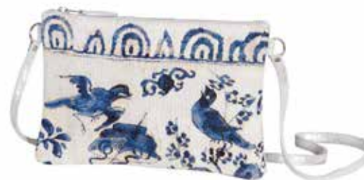
Clutch Deluxe Delft all over Gobelins with leather 17x27cm