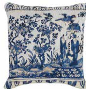
Pillow case All over Delft 45x45cm