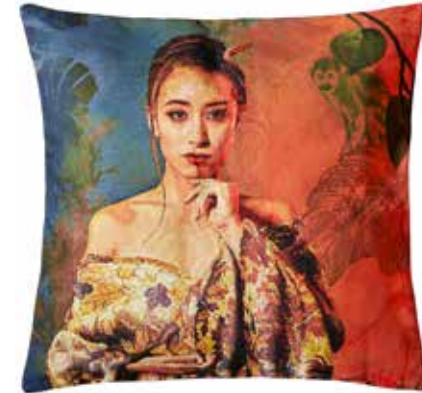
Pillow case Zaru Girl 70x70cm