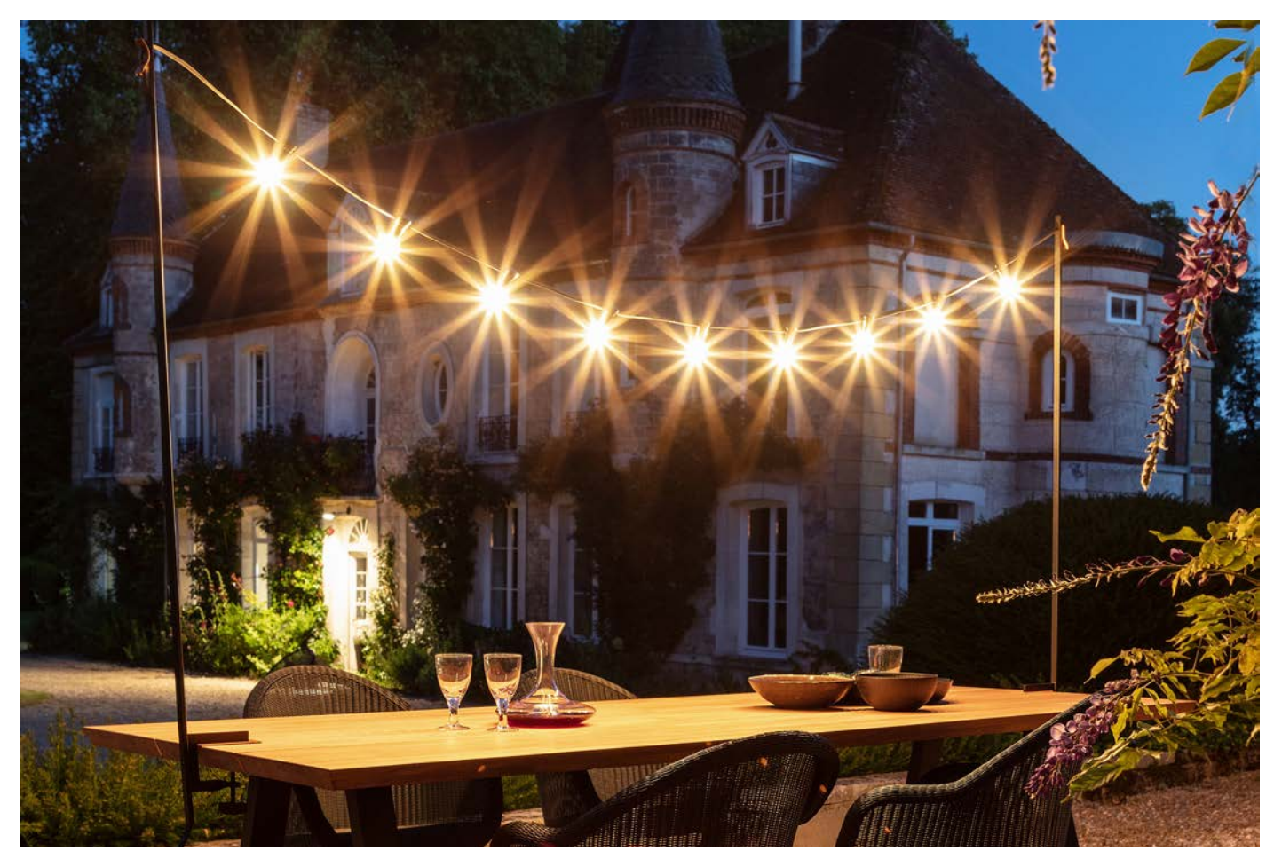
MORE INFO ON VINCENTSHEPPARD.COM